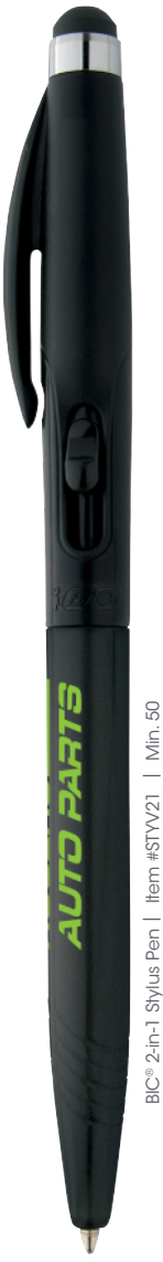
BIC® 2-in-1 Stylus Pen | Item #STYV21 | Min. 50