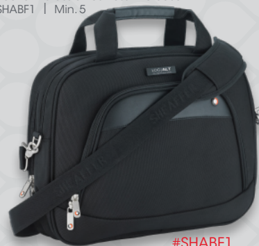
Sheaffer™ Classic Business Briefcase #SHABF1 | Min. 5