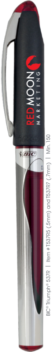
BIC® Triumph® 537R | Item #T537R5 (5mm) and T537R7 (.7mm) | Min. 150