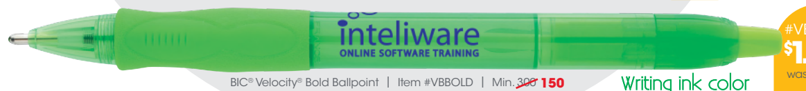
BIC® Velocity® Bold Ballpoint | Item #VBBOLD | Min. 150