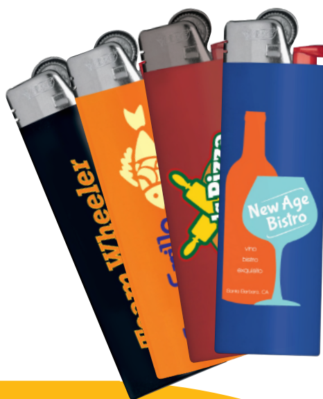
BIC® J26 Maxi Lighter | #LTR | Min. 200