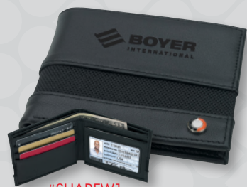
Sheaffer™ Classic Bi-Fold Wallet #SHABFW1 | Min. 10

promo M0296 code Must reference for special pricing.