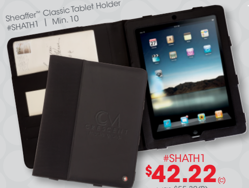
Sheaffer™ Classic Tablet Holder #SHATH1 | Min. 10