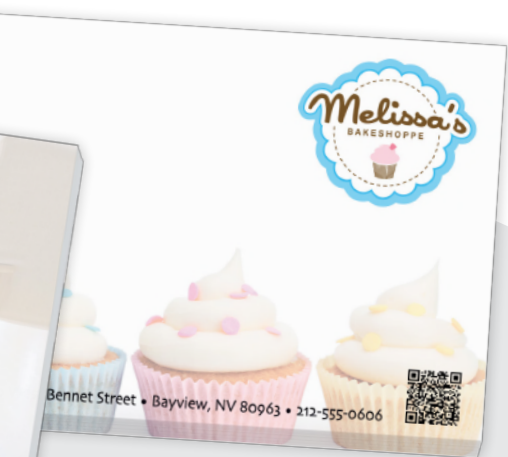
BIC® 4" x 3" Adhesive Notepad, 25 Sheet | Item #P4A3A25 | Min. 250