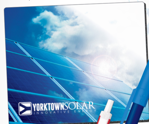
Antimicrobial* Mouse Pad 7 1/2" x 8 1/2" #MPAB1A | Min. 100