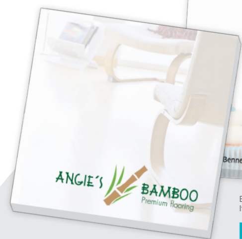
BIC® 3" x 3" Adhesive Notepad, 25 Sheet | Item #P3A3A25 | Min. 250